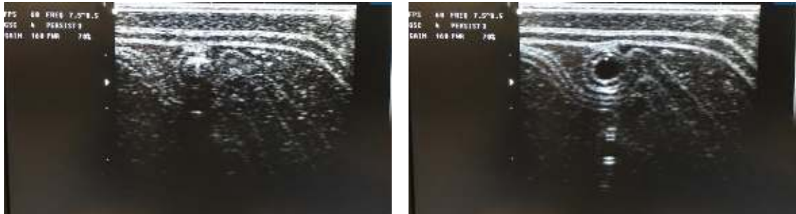
Image on left shows air bubbles negatively impacting image quality; image on right shows high quality image after more blood has been inserted