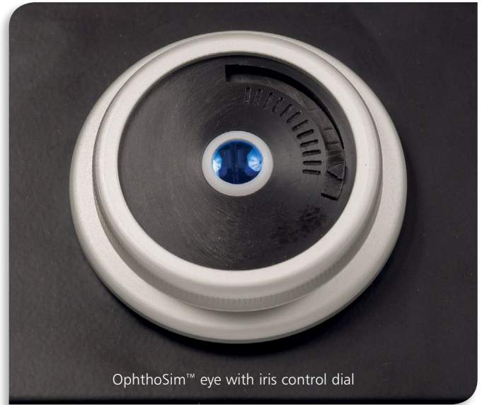
OphthoSim™ eye with iris control dial